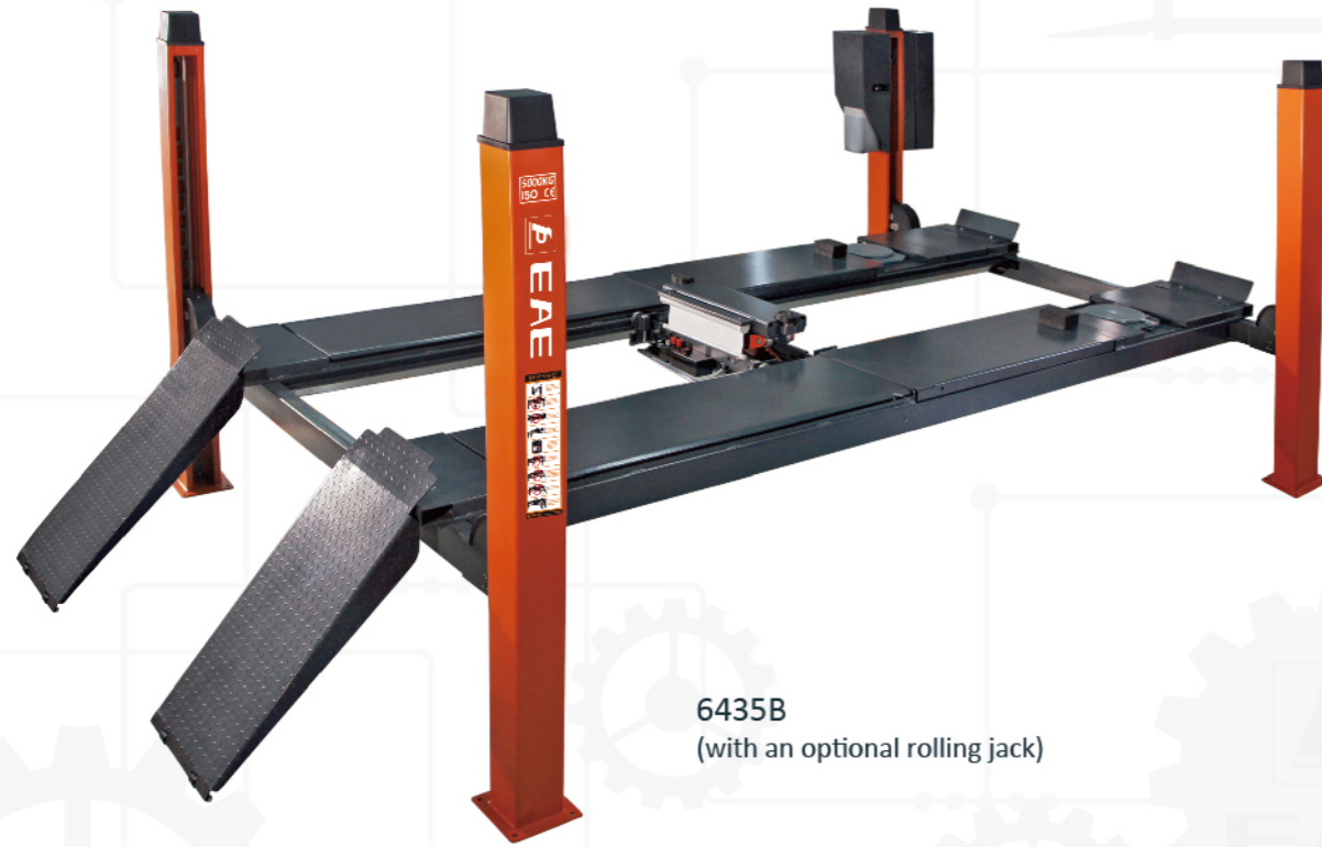
6435B (with an optional rolling jack)