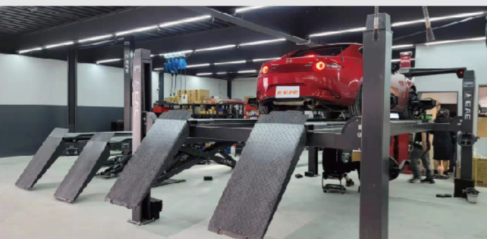
Solid and Robust Cable Pulleys