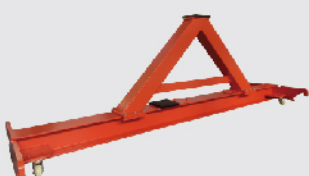
Crossbeam support and Triangle height extension support (Optional)