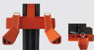
Adjustable wheel supports accommodate tire diameters from 600mm to 1250mm