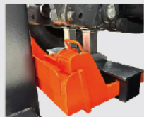
Height extension support 200mm and Beam support (Optional)