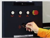
Control is only permitted at a authorized column