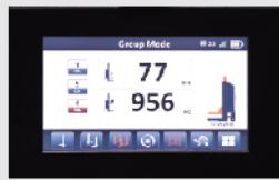
HMI Screen (Optional weight indicator)