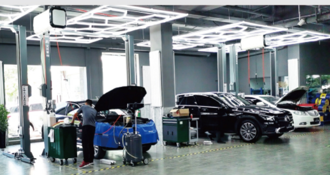
3-Stage Short Arm And 2-Stage Long Arm (C9Z/C10Z)