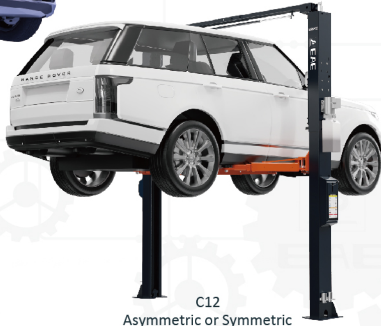
C12 Asymmetric or Symmetric